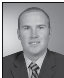
Ty Patton Men's Basketball SID